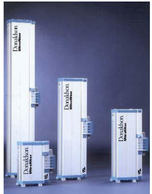
Oilfreepac® 2000 Standard

The final particle filter (3) removes all particles which might be carried over from the adsorption stages. While one vessel with desiccant cartridges is in the drying phase (adsorption), the other cartridge is being dried again (regeneration). A partial stream of dried air is expanded to atmospheric pressure via an orifice (6) and led across the desiccant cartridge for regeneration and via a solenoid valve and a silencer system to atmosphere.