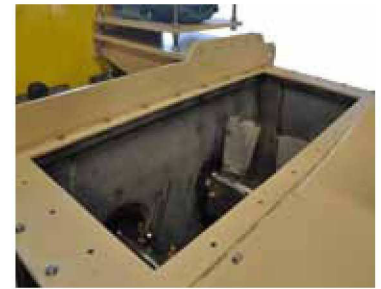
Large Inlet Opening