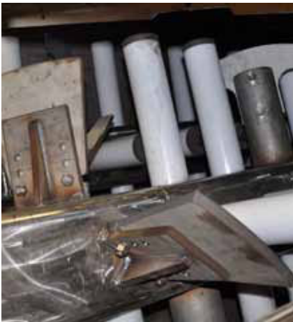
Shaft, Pin and Paddles